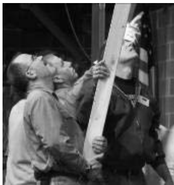
Choir dads construct the 2005 Tree