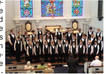
Performance at Spoleto

The first leg of the 2006 Summer Tour began in Charleston, South Carolina. The Concert Choir performed at the renowned Piccolo Spoleto Festival as part of the Youth Music Series. The performance was held in historic Second Presbyterian Church and was one of the best performances by the Concert Choir. Following the