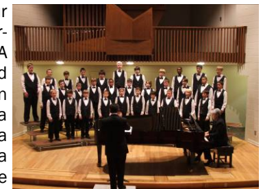
Performing at The University of Montevallo

The second leg of 2006 Summer Tour began with a performance at the University of Montevallo in Montevallo, AL. A small but enthusiastic audience raved about the performance in the Lebaron Concert Hall. The next day began with a track and museum tour at the Talladega SuperSpeedway followed by lunch and a walking tour of Samford University. The afternoon was spent in a joint rehearsal with the Birmingham Boys Choir followed by an evening of fun at their host