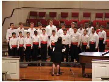
2005-2006 Concert Season!