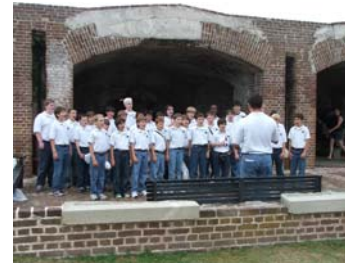
Impromptu concert at Fort Sumter